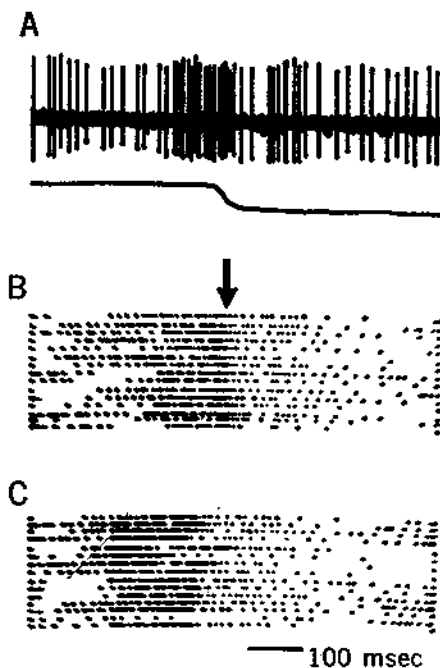
Fig. 1. Cell discharge associated with eye movement. (A) The rate of cell discharge increases before the eye moves from left to right through 20 degrees of arc (indicated by the deflection of the electrooculogram in the lower trace). (B and C) Each discharge of the same cell is indicated by a dot produced by intensifying the beam of an oscilloscope. A dot also indicates the beginning and end of each line. Successive lines are associated with successive eye movements. In (B), the start of each line is time-locked to the eye movement; each line begins 400 msec before the left-to-right eye movement, which occurs at the arrow in the middle of the line. In (C), each line is time-locked to the jump of the fixation point stimulus rather than to the eye movement. Each line starts at the time of the stimulus jump; the cell discharges and eye movements are the same set shown in (B).

Each cell had a particular direction of eye movement associated with its most vigorous rate of discharge; the opposite direction of eye movement was associated either with no change in the firing rate or with a decrease. Thus, for the cell in Fig. 2A (the same cell as in Fig. 1), a horizontal eye movement from left to right (shown by a downward deflection of the electrooculogram) is preceded by a burst of cell activity, whereas the movement in the opposite direction is accompanied by a pause in the cell discharge. The optimal direction of eye movement was flanked on both sides by a range of eye movement directions that were associated with less vigorous responses. The entire range of eye movement directions varied from cell to cell from 50 to 135 degrees. The optimal direction of